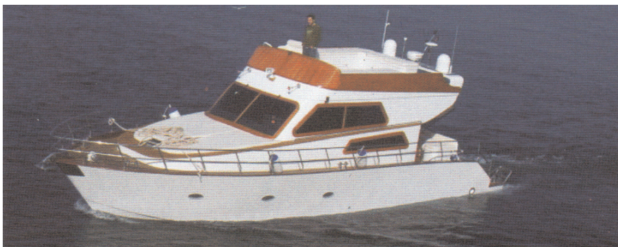
Hekim's business includes building small boats.