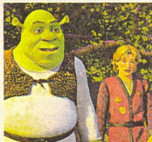
Shrek hangs out with Fiona's cousin Artie (Diaz's real-life ex Justin Timberlake).

Myers: Justin does a great job. Diaz: Justin is wonderful in the film. [Smiles.] He is great in it. Awesome.