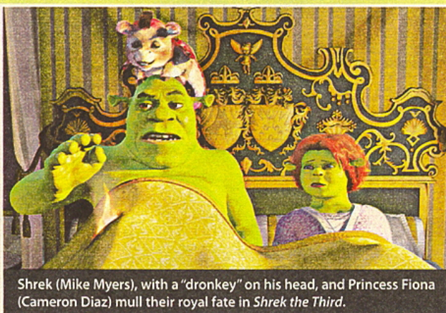
Shrek (Mike Myers), with a "dronkey" on his head, and Princess Fiona (Cameron Diaz) mull their royal fate in Shrek the Third .

Diaz: One thing I want to make sure people know about the princesses is that this is not about girls being aggressive. The princesses are in self-defense mode when